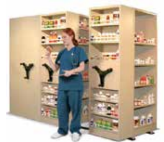
HIGH DENSITY MOVABLE SHELVING