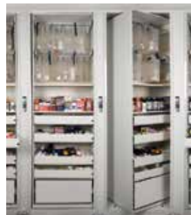
ROTARY STORAGE CABINETS