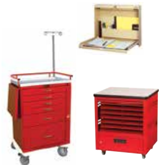
SECURITY CARTS AND WALLRIGHTS