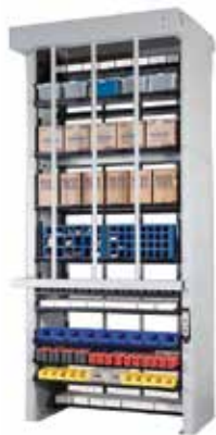
AUTOMATED VERTICAL CAROUSELS

space and people. We specialize in helping manage costs with organizational solutions to improve the flow of materials, maximize the use of floor space, and enhance the productivity of personnel.