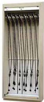
SPECIALTY STORAGE CABINETS