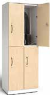
LOCKERS - KEYPED AND ELECTRONIC